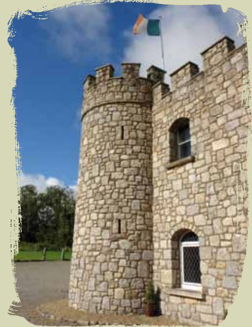
The Slaney Language Centre

The Slaney Language Centre was established in 1999. The Slaney Language Centre provides quality language tuition for adult language learners, professionals and families throughout the world. We are a small school where personal attention is given to each student. We pride ourselves on our low student-tutor ratio. The maximum number of students in any level group is eight.