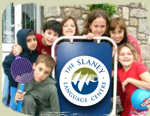
Making new friends on our Family Course

If you have children between the ages of 6 and 14, why not join one of our family courses? Following its success in the last few years, we are offering five courses for parents and their children, grandparents and their grandchildren etc. Family courses are very popular and fill up quickly. To secure a place we advise you to book as early as possible. Find out more on page 15.