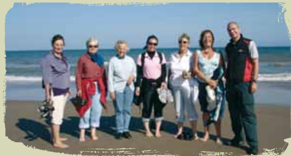
Students at Curraclloe Beach