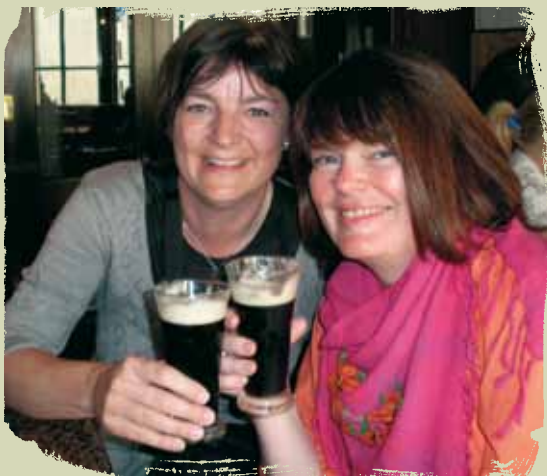
Student and hostmother

There is a famous Irish saying: 'A stranger is a friend you haven't met yet'.