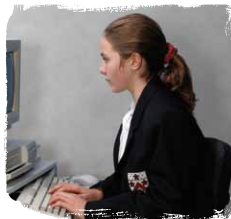
Secondary School Placement

Being a small and friendly town Wexford is a safe place for young people. It is also a vibrant place offering diverse activities in culture, recreation and sport. Please contact us for further details.