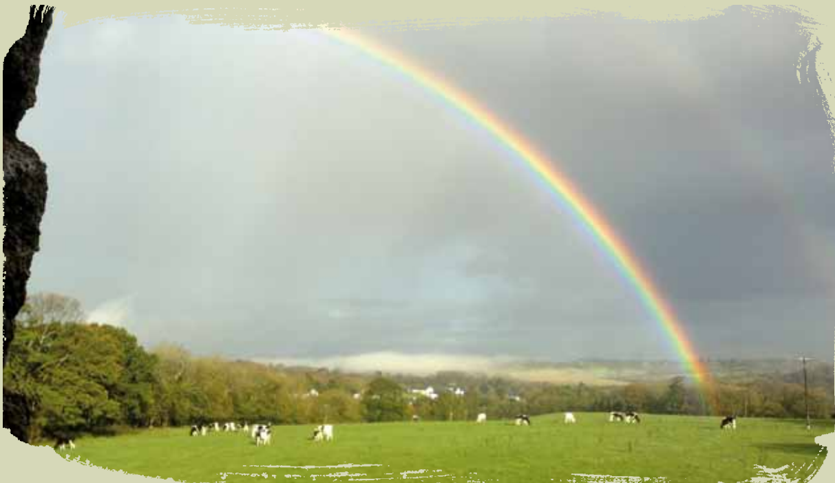
View from a Slaney Language Centre classroom window