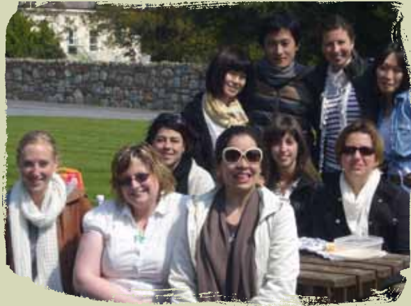
Students enjoying the June sunshine

The internationally renowned Wexford Festival Opera takes place every year during the last week in October and the first week in November. These two weeks are without a doubt the highlight of the Wexford social calendar and a magical time for all- not just for opera lovers. High quality events take place for all tastes such as concerts (classical, jazz, rock etc.), musicals, light operas, plays, art exhibitions, singing and swinging pub competitions just to name a few. If you have never experienced Wexford during the Opera Festival it's time to book your flight. Please check page 14 for more details on the Language and Culture Course