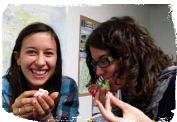
students at break time