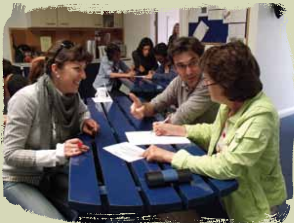
Slaney Language Centre quiz

Our language courses provide language learners with the opportunity to improve their language skills and gain confidence in a relaxed, friendly and encouraging environment with support from our dedicated staff. We develop the language students' listening, speaking, reading and writing skills with the main focus on oral fluency through a variety of conversation exercises.