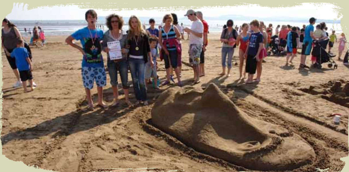
Family Course students taking part at a sand castle competition.

What other country gives you the opportunity to experience all four seasons in one day?