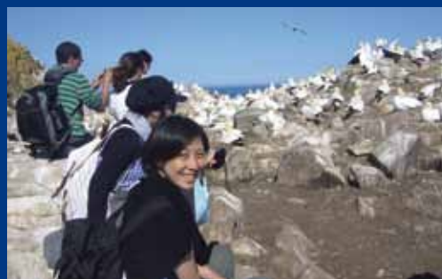
Birdwatching on the Saltee Islands

Please note: Minimum no. of students required for an afternoon activity: 5 Minimum no. of students required for a daytrip: 10