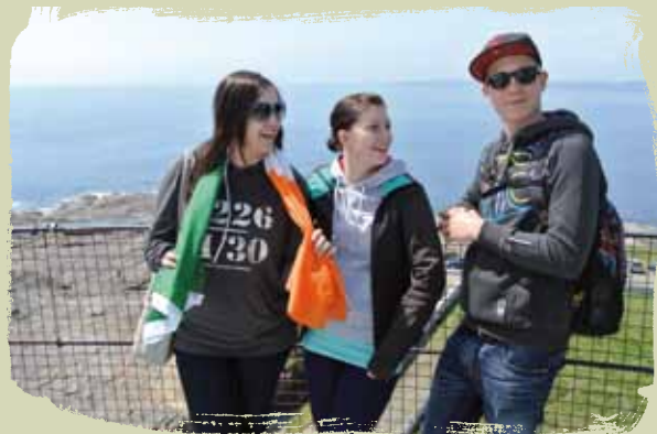
Students at The Hook lighthouse

English is the first language spoken in Ireland. Irish people speak with clarity and the standard of Irish education is high. Therefore you will have the opportunity to practise and develop your language skills everywhere you go in Ireland.