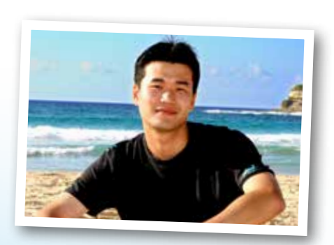
"After improving my English to a suitable level for employment I was able to start looking for a job. At SELC I got a good start with the job finding skills I needed and the advice and support to explore the options available to me for working in Australia at the end of my course'

A wide range of English ability levels are accepted, however for the commercial farms candidates should be able to pass a fitness test (lifting 15-20kg safely).