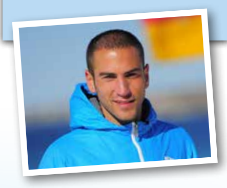
"I never missed the "free chat with the locals" conversation sessions after class at SELC. It gave me a chance to practice my English in a fun way and I learnt a lot about Sydney and Australian people as well"

Tim Tams and coffee are provided and all SELC students are invited to come along to practice their English and meet some of the local characters in these free afternoon sessions.